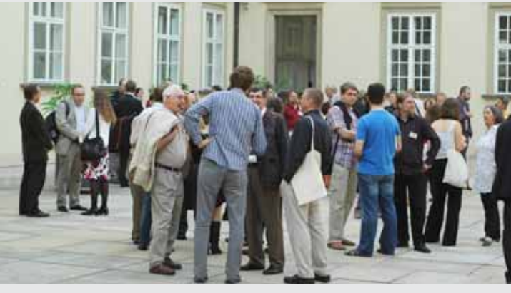
The annual conference of the EASR in 2008

The department is also active in the International Association for the History of Religions (IAHR) and the European Association for the Study of Religions (EASR). It has co-organized several important international conferences including two special conferences of the IAHR in 1994 and 1999, the annual conference of the EASR in 2008, and a conference of the International Study of Religion in Eastern and Central Europe Association (ISORECEA) in 2010.