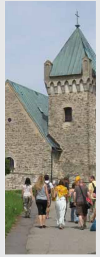
Annual excursion organized by the department

Our students enjoy a number of facilities and opportunities, including extensive opportunities with respect to international mobility and networking, various scholarship opportunities, an excellent library housing several thousand books devoted to the study of religions in English, an award-winning study information system allowing students to organize their studies without needless paperwork, queues and extra trips, and a high-quality student journal for the study of religions (Sacra).