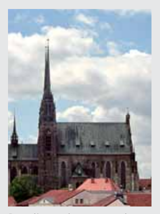
Brno lies at the crossroads between Prague, Vienna, Bratislava and Cracow

Brno, in which Masaryk University is situated, is a dynamic city boasting several large university institutions and pulsating with student life. It not only offers a wide assortment of theatres, galleries, cinemas, music clubs, festivals, and sports facilities but is also located in a region offering a variety of natural wonders. Furthermore, the city lies at the crossroads between Prague, Vienna, Bratislava and Cracow, which makes it an ideal location for exploring the Czech Republic and beyond.